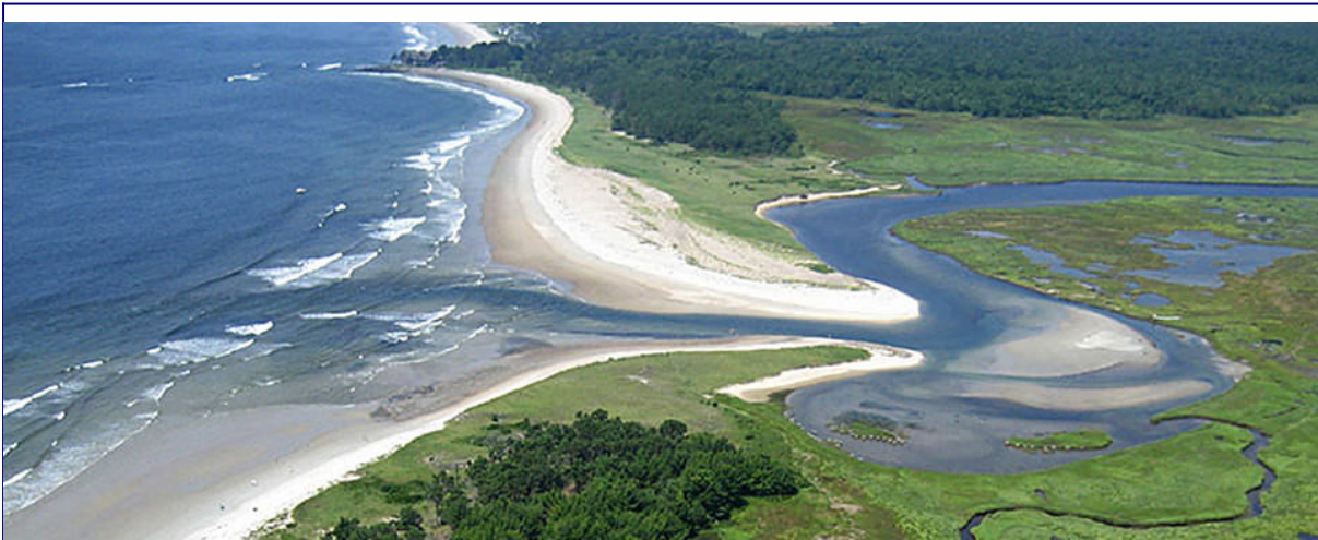
Figure 1: An estuary

We therefore propose a new layout and location for our lighthouse.